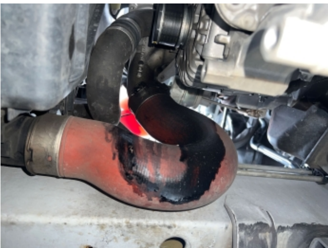
oil staining on turbo outlet hose, advise clean and monitor