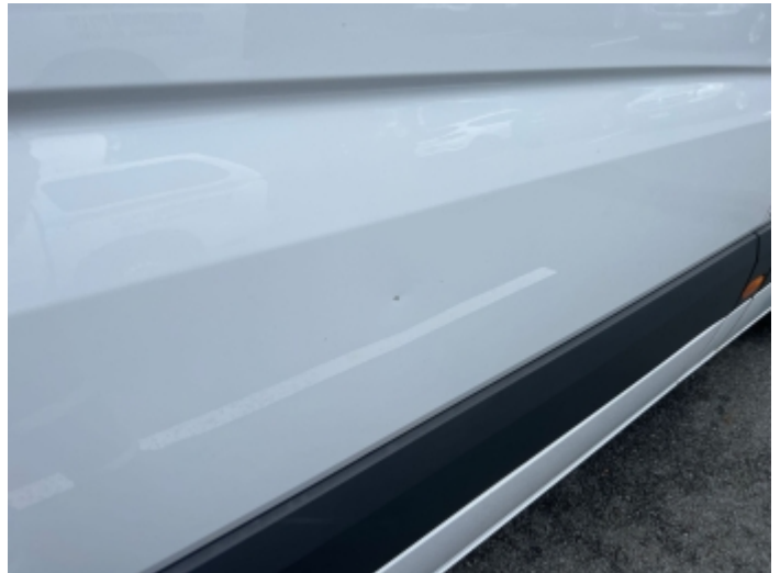
Minor chips and scratches noted