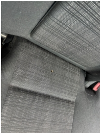
Burn marks in trim,General wear and tear to trims