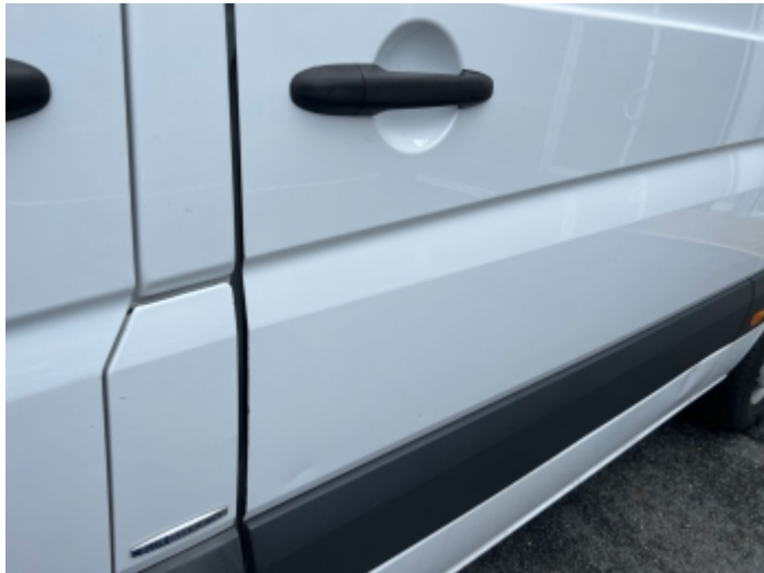
Minor chips and scratches noted