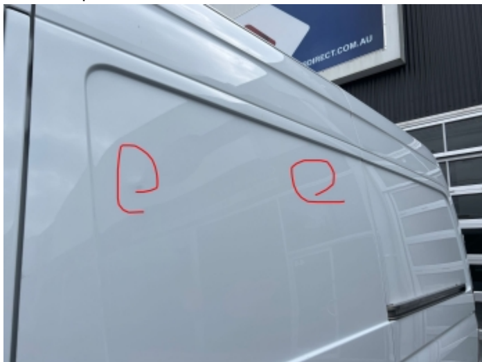
Dent in door panel