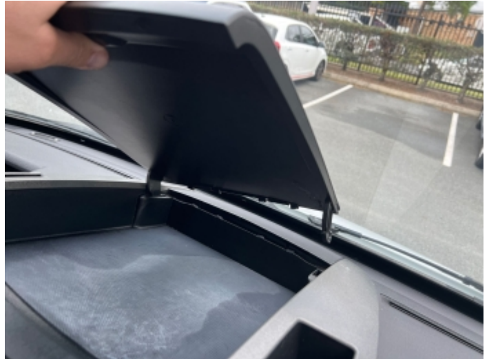
Console lid hinges broken