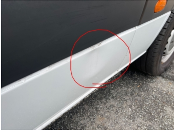
Dent in door panel