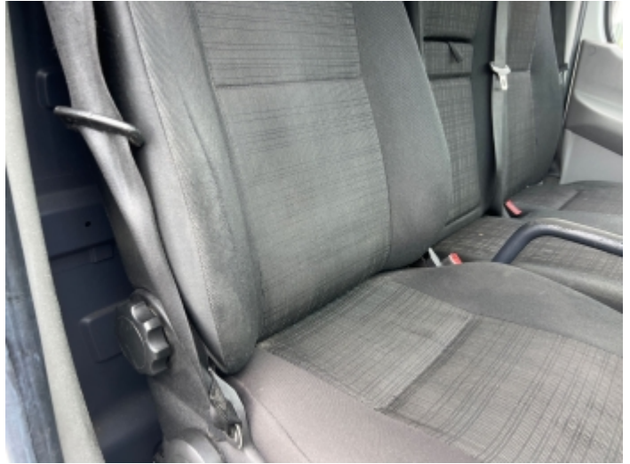
Burn marks in trim, General wear and tear to trims