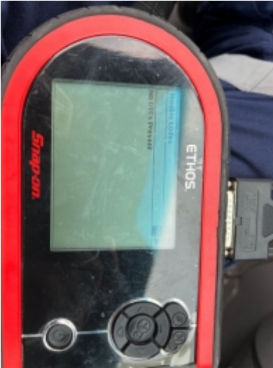
no diagnostic trouble codes present at time of inspection