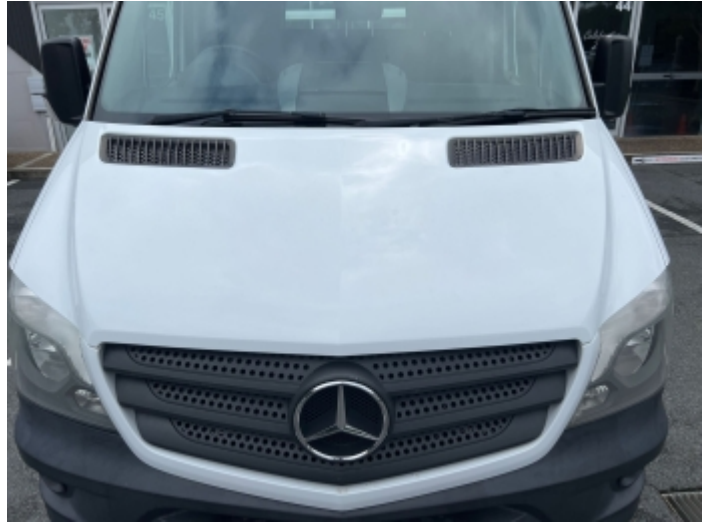
Minor chips and scratches noted