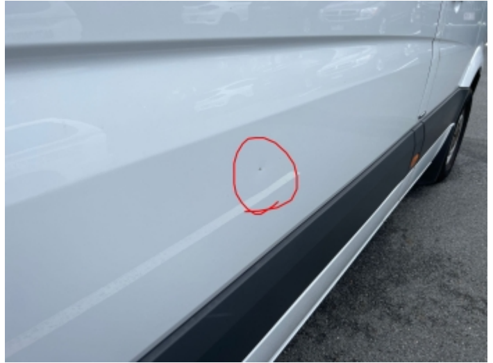
Dent in door panel