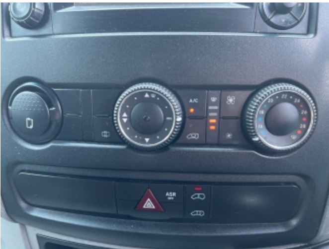
air conditioning operating and cold at time of inspection