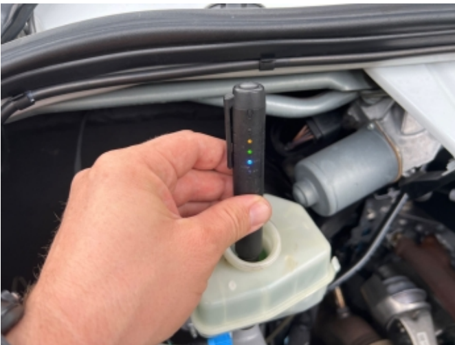
brake fluid ok