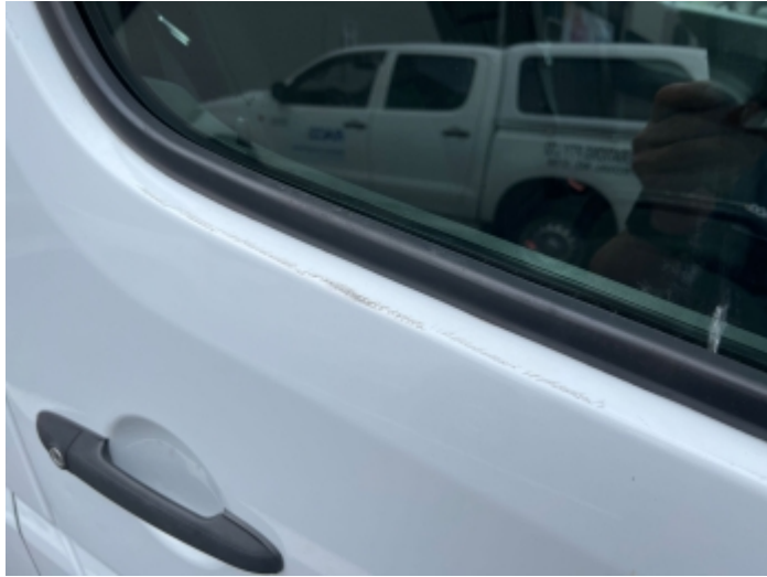
Refer Inspectors Comments