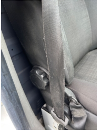
Webbing frayed on edges