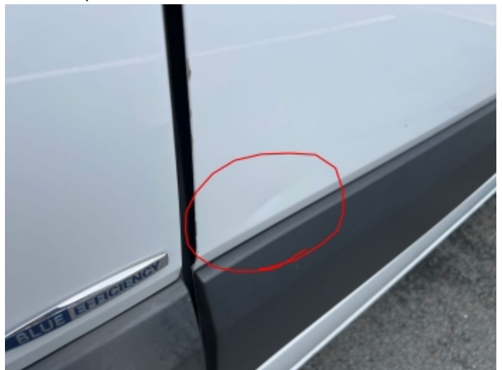
Dent in door panel