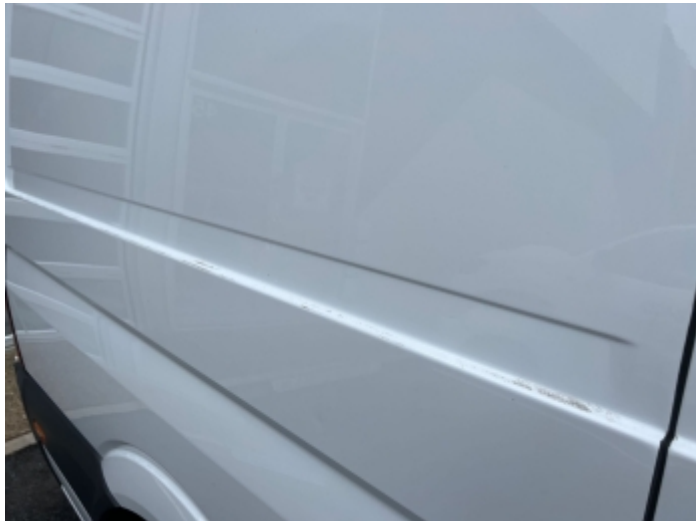
Refer Inspectors Comments