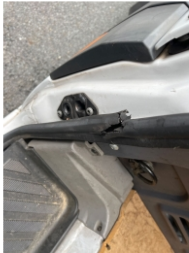
Door rubber split