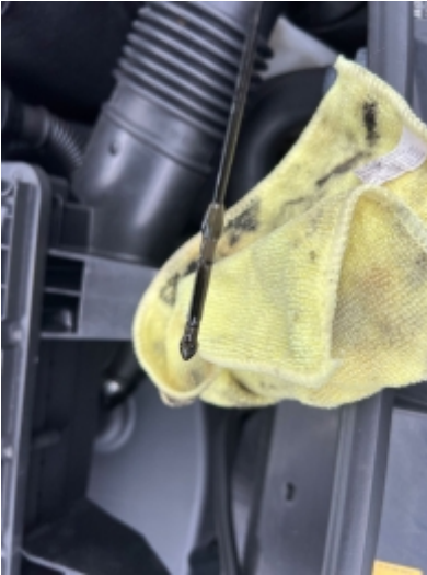
engine oil level ok