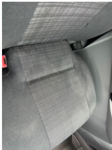
Burn marks in trim,General wear and tear to trims