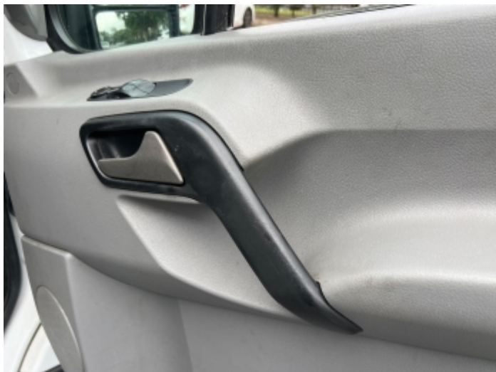
Burn marks in trim,General wear and tear to trims