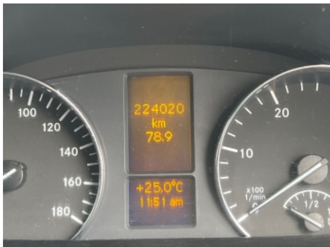
odometer before road test