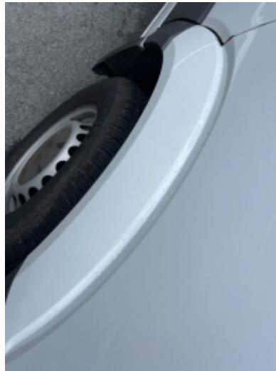
Refer Inspectors Comments