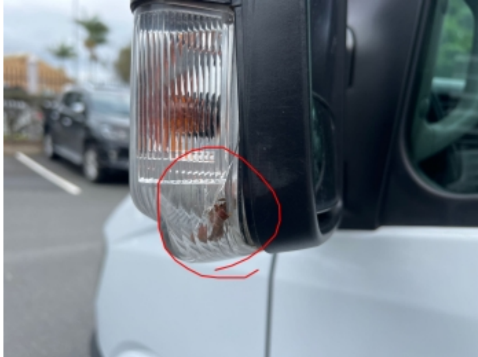
Indicator lens cracked

2 Interior/Exterior Lights Leftside Indicator Lights Indicator lens cracked