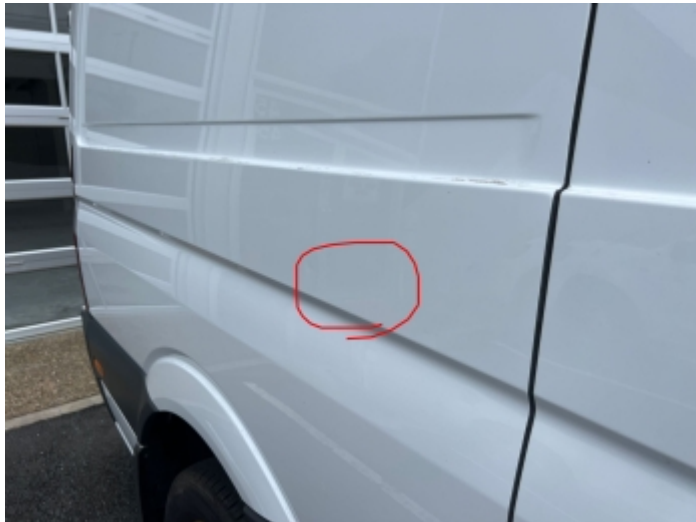
Dents in panels