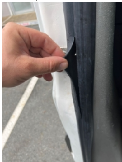
Door rubber split