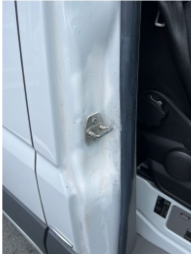
Refer Inspectors Comments