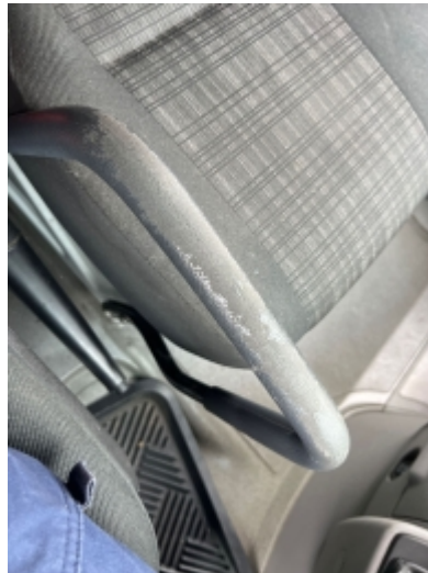
Burn marks in trim,General wear and tear to trims