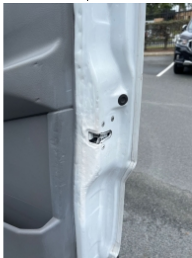
Refer Inspectors Comments