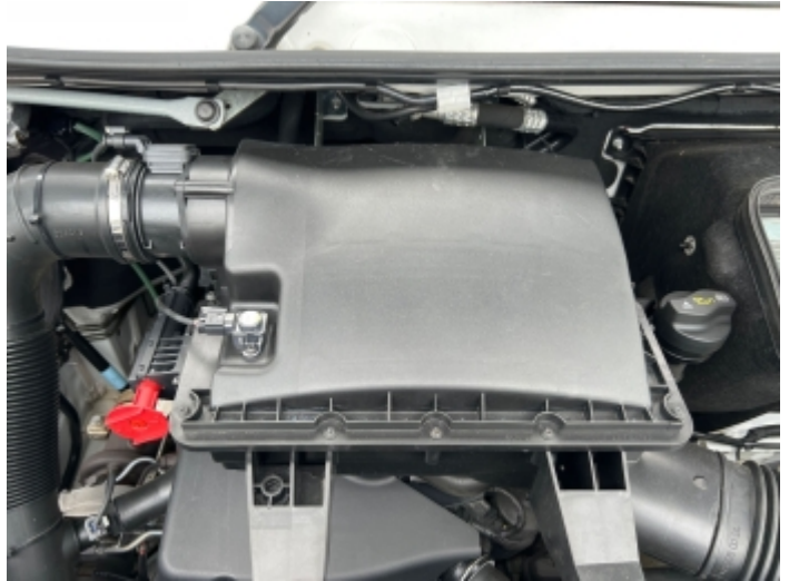
Unable to inspect air filter element, workshop attention required